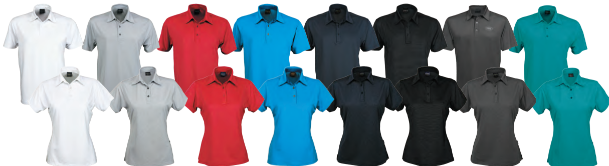
white/silver grey/silver red/silver ocean blue/silver navy/silver black/silver charcoal/silver teal/silver

Weights and measurements are approximate and for guidance only.