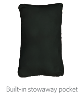
Built-in stowaway pocket